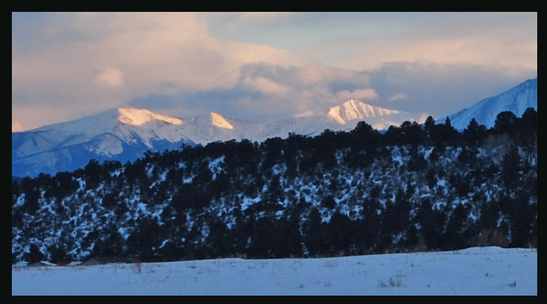
Sangre de Cristo