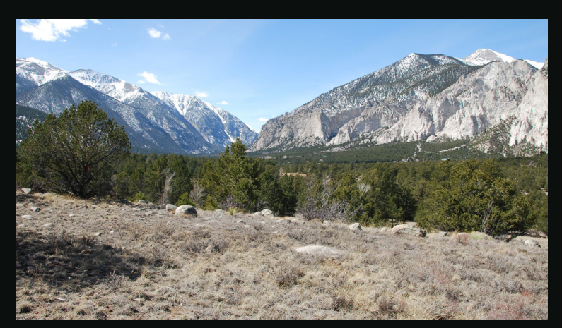
Canyon in springtime